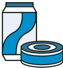
Aluminum + Tin Cans